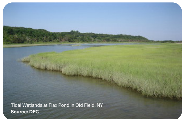
Tidal Wetlands at Flax Pond in Old Field, NY